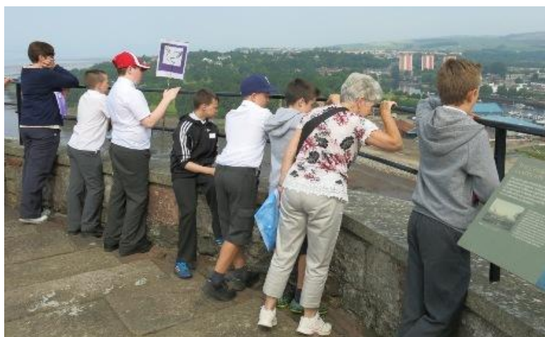
Where's my house?