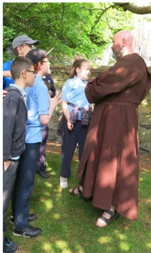
Good of the saint to drop in