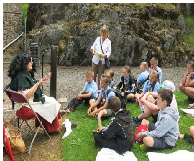
Washing details – castle style