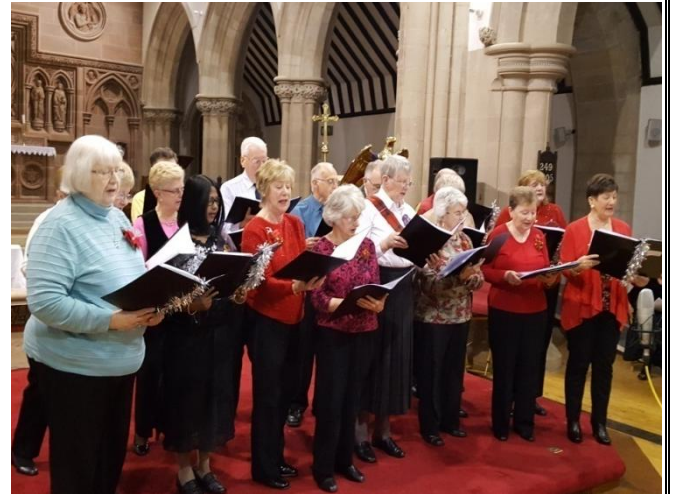
St Andrew's Night! A choral celebration with contributions from choirs from St Pat's, West Kirk, Riverside and All Sorts.