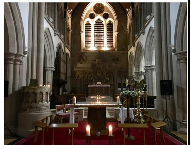
St Aug's looking beautiful for the Service in Remembrance for those who have died from addiction. We were joined by a congregation of 80. A very moving evening.